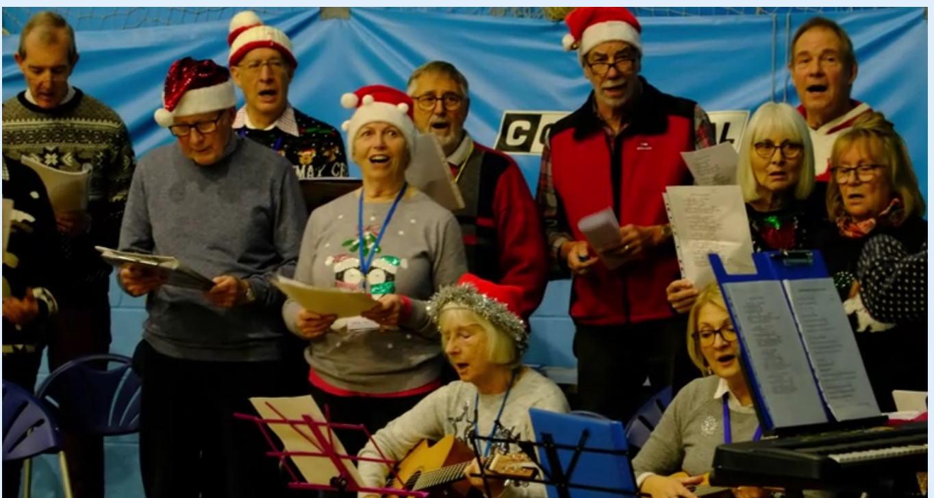
Some of our expanding folk music group in full voice