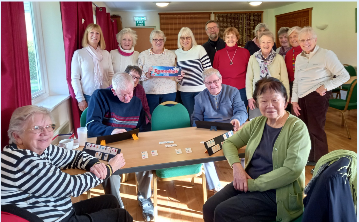
Rummikub Members enjoying a session together