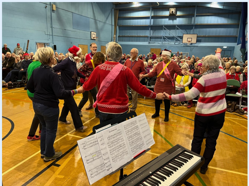
Country Dancing &