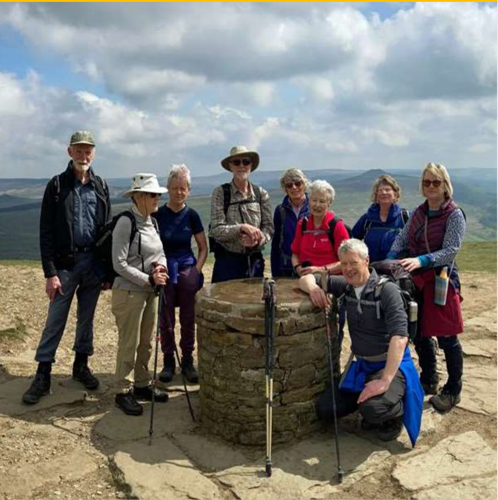
Peak Walking Group 2 on Lose Hill, Derbyshire