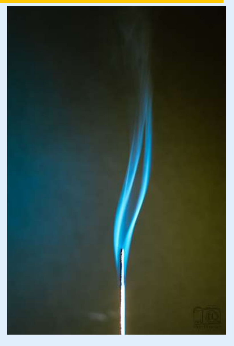
Slow Burning Incense

Hopefully many of you saw our presentation during the u3a Christmas party on December 5th, we showed some of our favourite images from the past year. We understand if you were there but missed it – during the