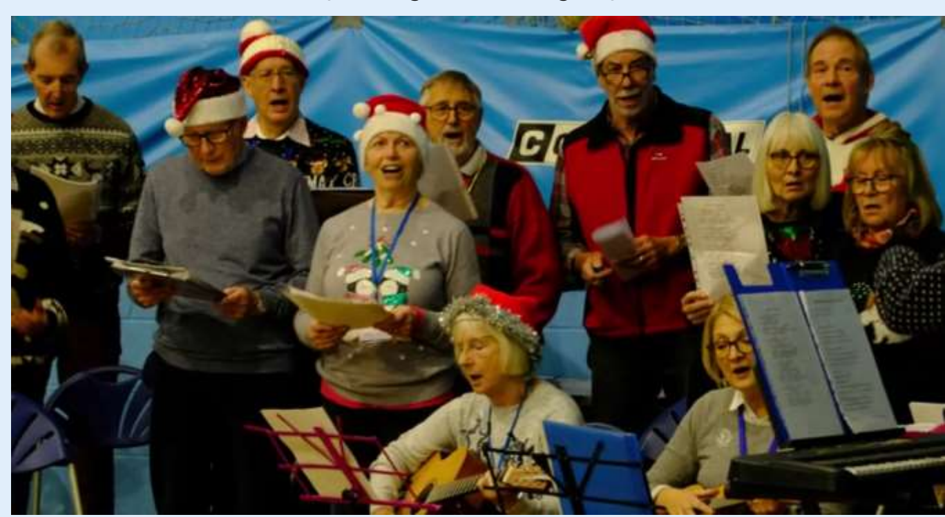
Southwell u3a Newsline January 2024 page 5

Some of our expanding folk music group in full voice