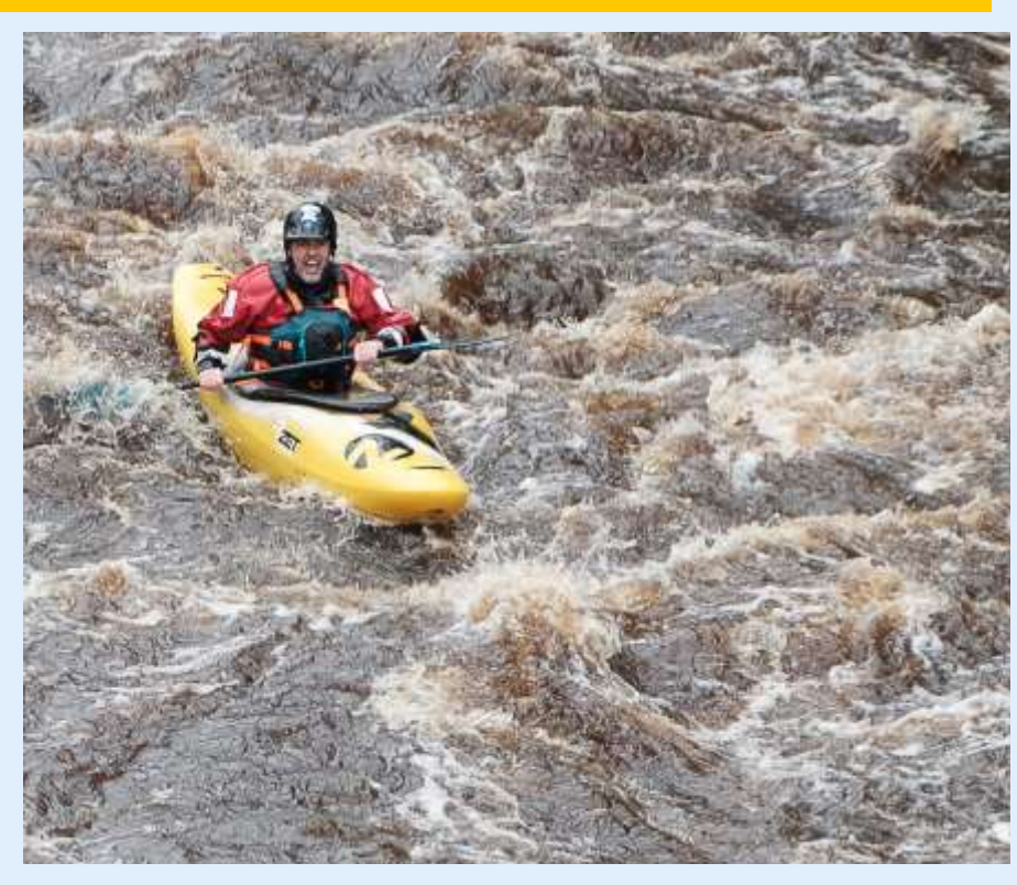
Fighting the flowing water

particular subject – editing, camera settings, etc. And if anybody needs help on any aspect of their camera, that is available on a one-to-one basis.